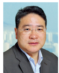
The Hon. Fred LI Wah-ming, SBS, JP 李華明議員，銀紫荊星章，太平紳士