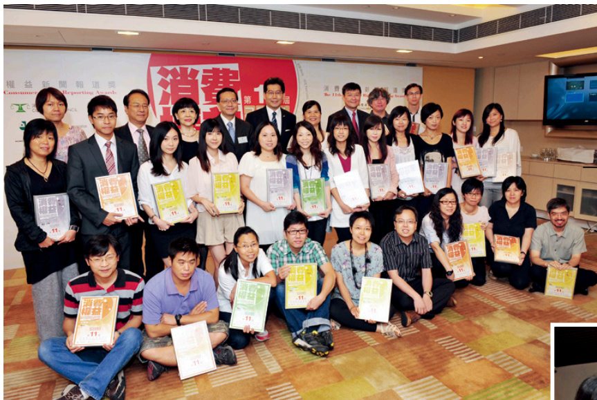
Winning recipients of the 11th Consumer Rights Reporting Awards with guests of the prize presentation. 第十一屆消費權益新聞報道獎得獎人與頒獎嘉賓合照。