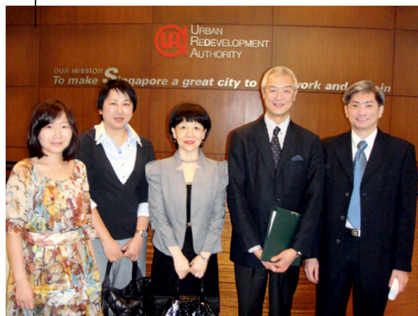
Council representatives paying visit to Singapore's Urban Development Authority to study the real estate information system in Singapore. 本會代表到訪新加坡市區重建局，了解當地物業資訊系統。