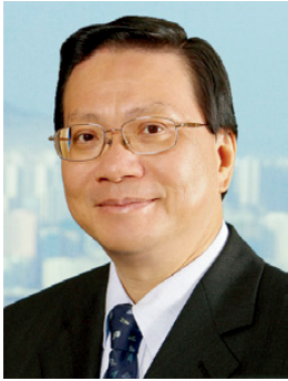
Prof. The Hon. Anthony CHEUNG Bing-leung, GBS, JP 張炳良教授，金紫荊星章，太平紳士