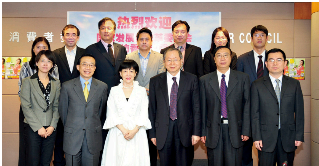
Representatives from National Development and Reform Commission visiting the Council. 本會歡迎國家發展和改革委員會到訪。