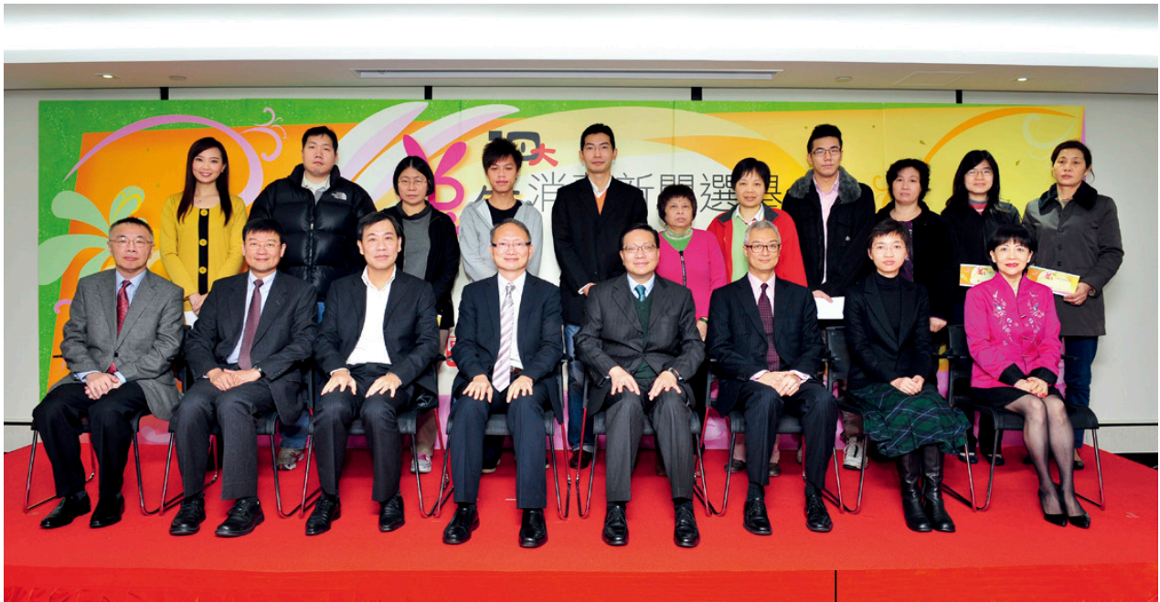
Winners of the Top Ten Consumer News for the Year of Rabbit competition and representatives of the annual event co-organizers posing for a group photo at the prize presentation. 兔年十大消費新聞頒獎禮後，各合辦機構代表與得獎人合照。