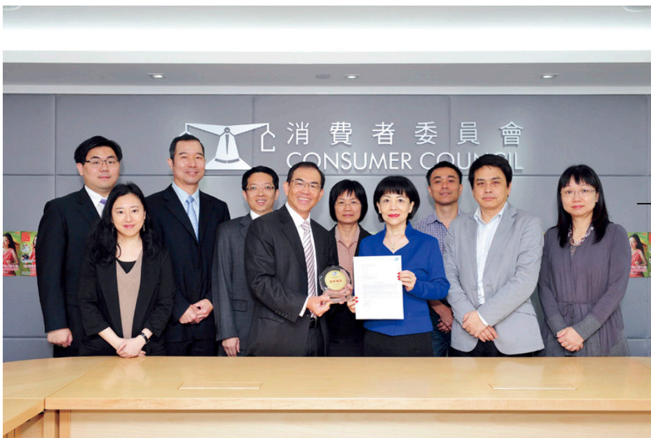
The pharmaceutical industry appreciated the Council's effort in fighting against counterfeit drugs. 製藥業感謝本會參與打擊假藥的工作。